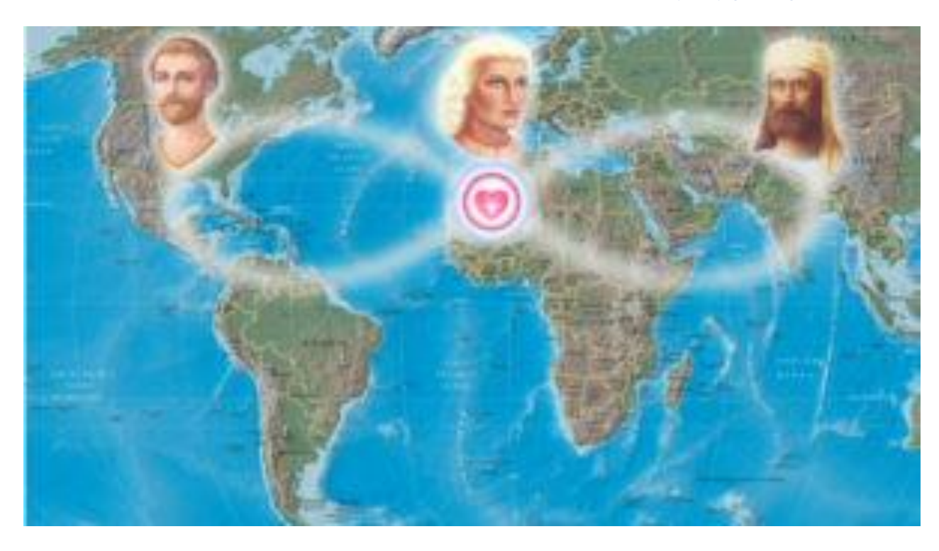
"The Lord Sanat Kumara has determined to place himself at that mighty nexus of the figure eight wherever it occurs. Thus, through the mighty heart of the Ancient of Days, the light that translates between you shall fulfill both aspects of the law – that of accelerating light in the earth by his mighty heart and that of bearing the cross of planetary karma." (Unpublished dictation, used by permission of the Summit Lighthouse, December 29, 1979)

In another landmark dictation of 1979, beloved Chananda released a powerful thought form for a perfect figure eight flow of cosmic energies between India and America and the significance of this relationship for the fulfillment of the divine plan for the planet Earth. He said, "We send forth the thought form of the converging of the flames of East and West. ............. Therefore, placing the focal point of the Mother and her chelas in the West as one extreme of the figure eight, we desire to see the nucleus of light in India established so that there can be a perpetual flow over this figure eight, and over that flow the transmutation of planetary karma. Considering then that this forcefield is now one end of the figure eight, you can with your mind's eye place your finger at that extreme point at the figure eight: and now you can imagine that figure eight rotating over the entire surface of the Earth, so that wherever there is an ashram of light, a community teaching center, there becomes the extreme, the other point of the figure eight."